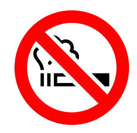
Smoking under the age of 21 is an offence in Singapore.

Smoking is an offence in places such as shopping centres, restaurants, cinemas, public transports and lifts.